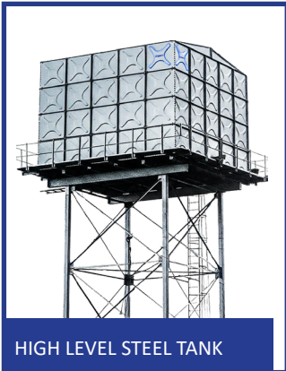
HIGH LEVEL STEEL TANK