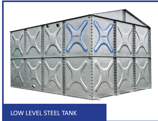
LOW LEVEL STEEL TANK

Custom steel tanks & towers made to your specifications. Call now for your quote!